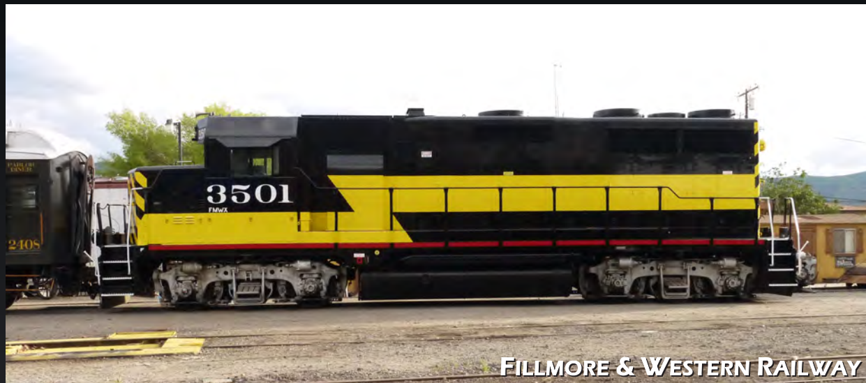
FILLMORE & WESTERN RAILWAY

The Santa Clara River Valley Railroad Historical Society was established in 1993 to assist in the preservation and restoration of the railroad corridor between Montalvo and Saugus, California. This railroad corridor, commonly referred to as the Southern Pacific's Santa Paula Branch, is a unique and historic asset to the residents of the Santa Clara River Valley and the surrounding area. To maximize the economic, educational, and recreational value of this asset, the Organization will acquire, preserve, exhibit, and operate historic railroad equipment; in addition, it will collect, preserve and display artifacts, photographs and operational documents unique to the region.