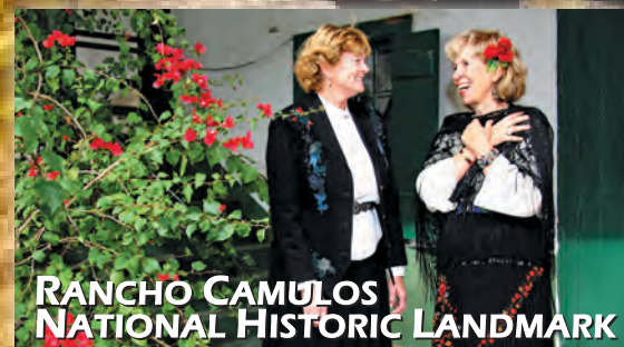
RANCHO CAMULOS NATIONAL HISTORIC LANDMARK