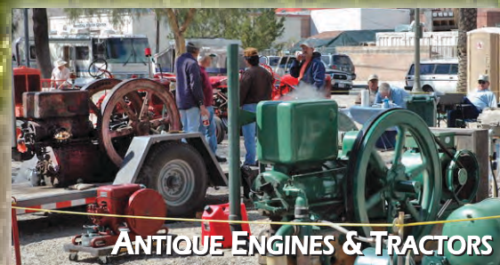
ANTIQUE ENGINES & TRACTORS