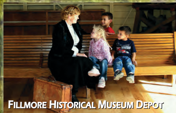
FILLMORE HISTORICAL MUSEUM DEPOT

Santa Clara River Valley Railroad Historical Society's Railroad Visitor Center 455 Main St., Fillmore, California 93015 Also, visit us on the web at www.scrvrhs.com